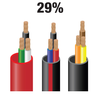
600V Copper 3/C 4 AWG XHHW in 1.25" HDPE Schedule 40