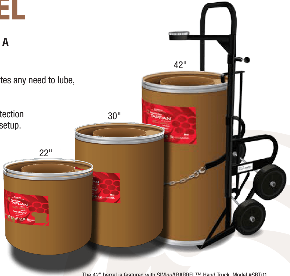
The 42" barrel is featured with SIMpull BARREL™ Hand Truck, Model #SBT01