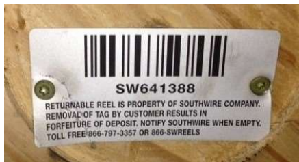
Figure 1: Returnable Reel Tag