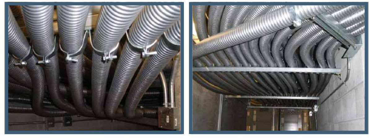
MC cable secured every 6' with straps and clamp

Straps and cable clamps — A variety of straps, clamps, staples and hangers are available to secure specific sizes of MC cable directly to the supporting surface. Before ordering clamps make sure that you have selected the correct clamp size. Verify the overall dimensions of the MC feeder cable and compare them with the published clamp sizes. Use any of these supports only for the MC cable size indicated on the hardware or on the support packaging. In vertical applications, NEC<sup>®</sup> 330.30 allows MC cable to be secured at intervals not exceeding 10 feet for cables with ungrounded conductors sized 250kcmil and larger.