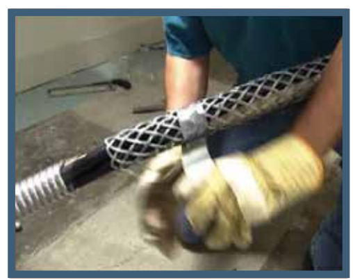
Securing basket grip to conductor assembly to avoid pulling conductors out of armor