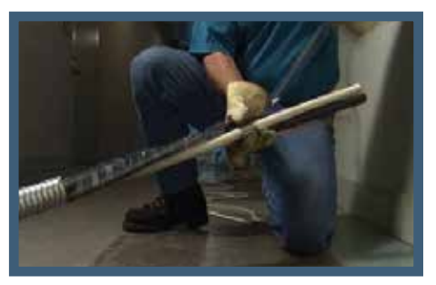
Removing mylar tape from conductors