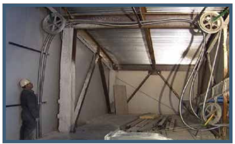
Example of using multiple sheave wheels to achieve required bending radius

Sheave wheel sizes and types – When pulling cable around bends, large sheave diameters will reduce the amount of sidewall pressure created at each bend. If you have a large bending radius you may not be able to find a radius roller large enough to meet the required bending radius for this installation. Large cables 1 AWG – 750 kcmil may require the use of radius rollers, in which are multiple wheels mounted together provide the required bend radius.