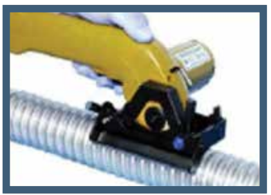
Using motorized saw to cut armor sheath to cut two adjacent convolutions on armor between 1.8 & 5 inches

Motorized ring cut saws deliver fast cutting for both lengthwise cuts and ring cuts. They handle cable up to 5 inches in diameter.