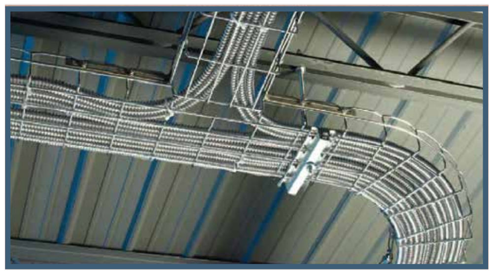
Wire Mesh Support System with Type MC cable

Basket type wire mesh – Basket type wire mesh cable supports — also called wire basket support systems — are gaining acceptance as a dedicated support system. These basket trays are lightweight and easy to install. They can be used for either vertical or horizontal installations. When used as a support system, they are not classified as cable trays in the NEC<sup>®</sup> handbook.