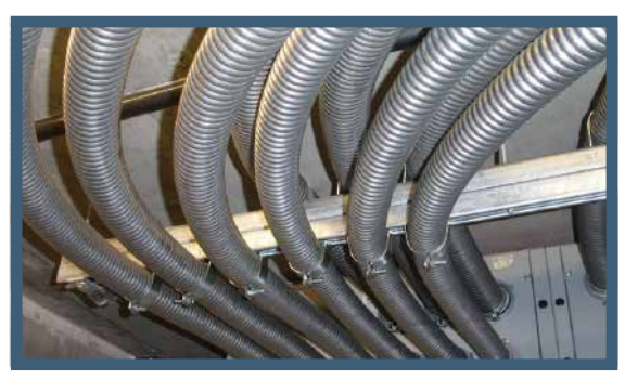
MC cable using strut support systems