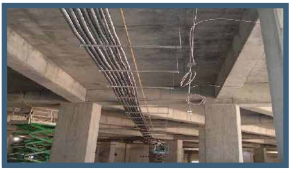
MC cable using trapeze support system

Straps and cable clamps — A variety of straps, clamps, staples and hangers are available to secure specific sizes of MC cable directly to the supporting surface. Before ordering clamps make sure that you have selected the correct clamp size. Verify the overall dimensions of the MC feeder cable and compare them with the published clamp sizes. Use any of these supports only for the MC cable size indicated on the hardware or on the support packaging. In vertical applications, NEC<sup>®</sup> 330.30 allows MC cable to be secured at intervals not exceeding 10 feet for cables with ungrounded conductors sized 250kcmil and larger.