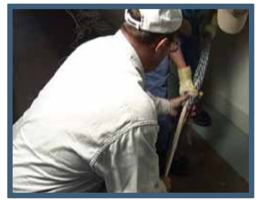
Securing pull rope to cable assembly