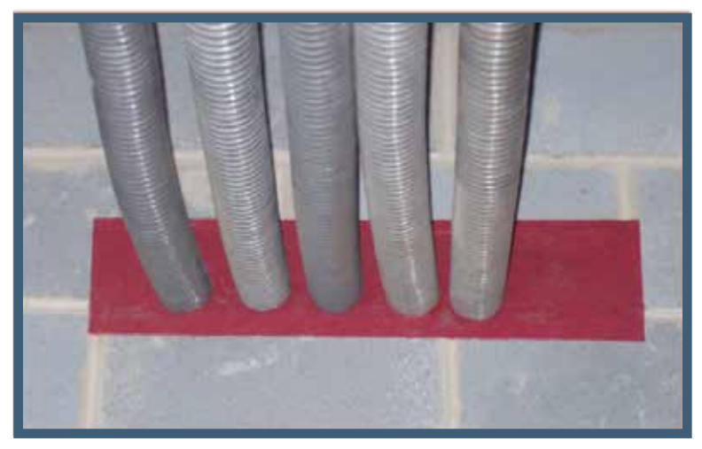
MC feeder cable in wall with fire stop

Type MC cables are well suited for installation in fire-rated walls floors and ceilings. The required fireresistance can be obtained by sealing the openings around cables using a UL-listed method – such as fire caulking or pads – where the cables pass through a rated wall, floor or ceiling.