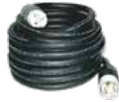
Temporary Power Cord