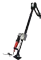
Maxis® 6K Cable Puller with Motor