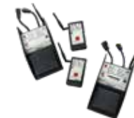
TRIGGERS® Wireless Safety Switch System