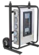
Temporary Power 3-Phase Distribution Cart