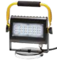
Slim Series 15W, 30W, and 50W LED Work Light with Magnet