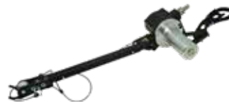
Maxis® XD1 Extreme Duty Circuit Puller