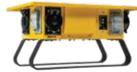
Temporary Power Distribution Box