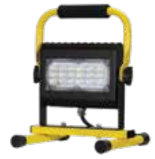
Slim Series 15W, 30W, and 50W LED Work Light