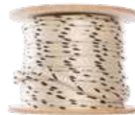
QWIKrope® Feeder Pulling Rope