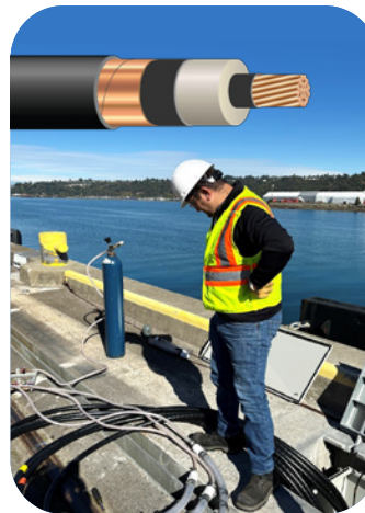
The wet MV power cables were purged using a compressed nitrogen gas tank on-site at the docking station. Three sets of cables were simultaneously purged using a custom-built manifold.