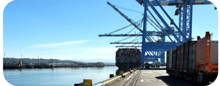
This is one of the busiest ports where ships load and offload containers on an hourly basis.

*Approximate material cost savings are based on 2024 standard product costs.