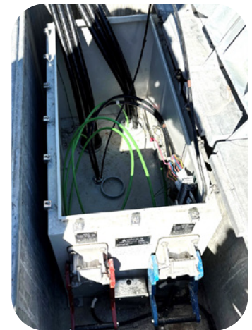
The cables were dried, restored to their original state, and then terminated in the power distribution box. The installed cables also passed Acceptance Testing and are ready to deliver critical shore power for many ships that will dock at the port.