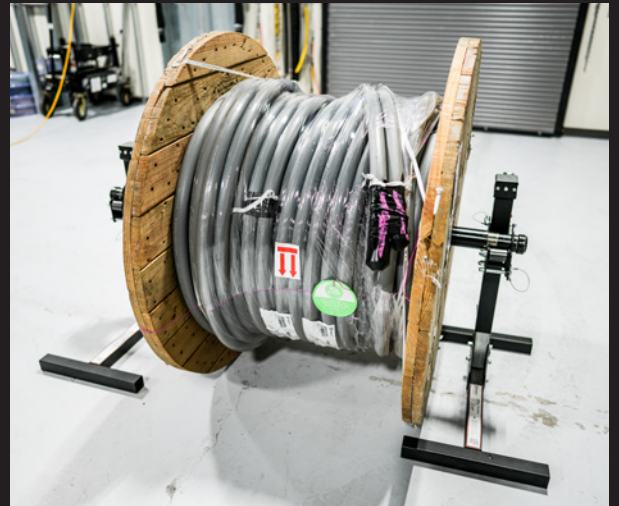
TWO CONDUITS ON A SINGLE REEL